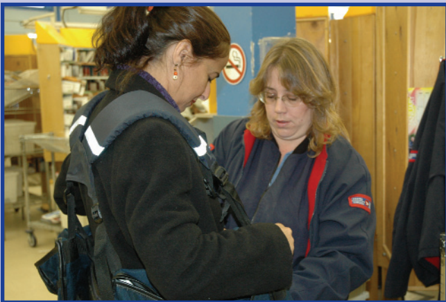
Brazilian postal worker trying on mail carrying satchel at an Ottawa letter carrier station