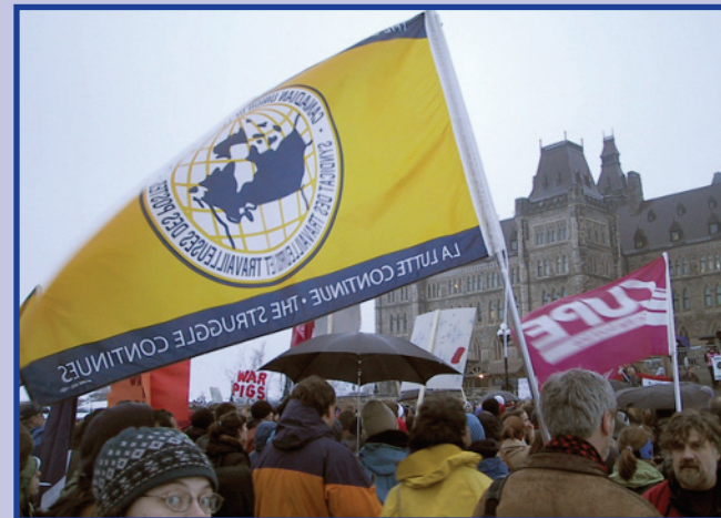
CUPW members protesting against the war in Iraq

The pressure to privatize public services in North America comes from the same model of globalization as in Guatemala, Colombia and the global South.